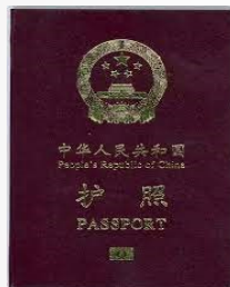
FORM I-551 STAMP ON PASSPORT