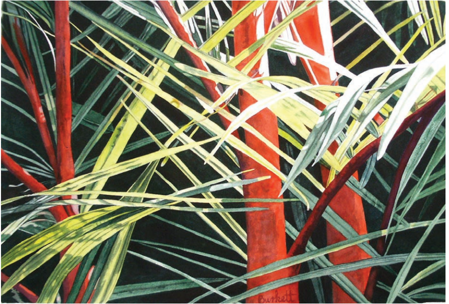
Helen Burkett Crimson and Gold 2020

My work is transparent watercolor using line, mass, and contrasting values and colors to create abstract rhythmic patterns within a representational image.