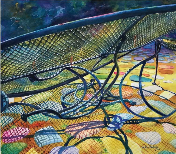
Vicki Morley Toppled Table 2019

When arriving at our summer home in Northern Wisconsin in the Spring, we discovered that the deep snow had slid off our metal roof and crushed our wrought iron patio table. After documenting the “toppled table” with a photograph, I discovered that it had a very fun abstract design which was the inspiration for this painting.