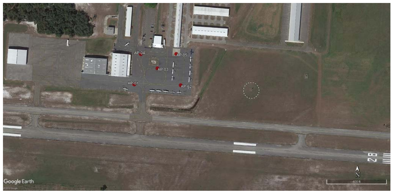
Boring Locations Map