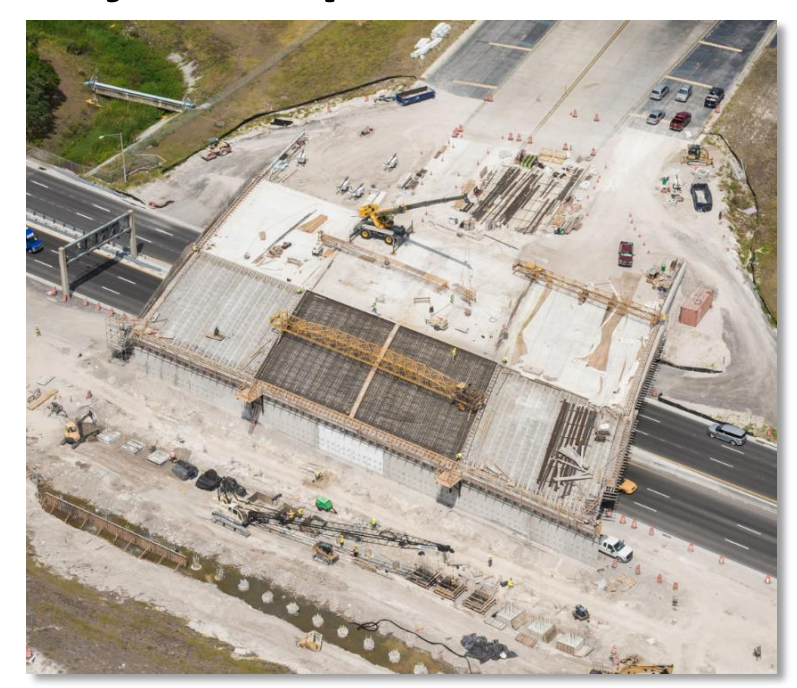
April 2016 May 2016

Project is on schedule for completion in September, 2016.