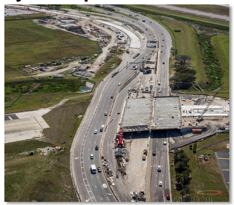
Project is on schedule for completion in September, 2016.