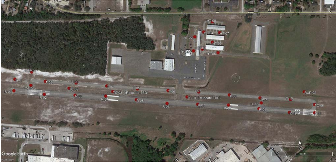
Boring Locations Map