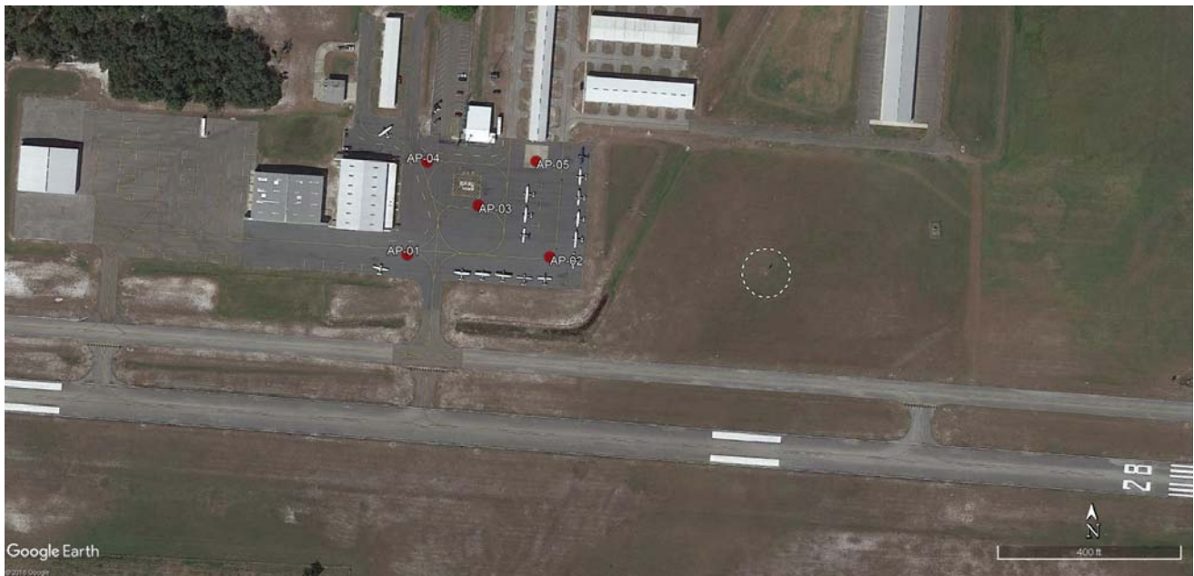
Boring Locations Map