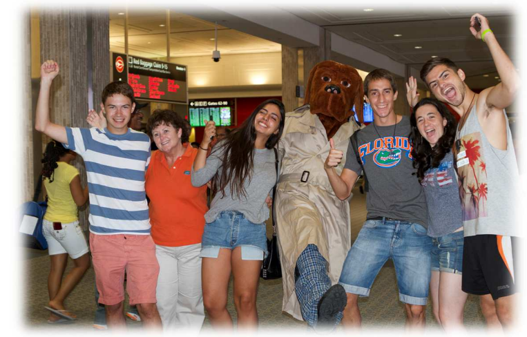
The above photo illustrates traveling patrons of TIA having fun with McGruff.